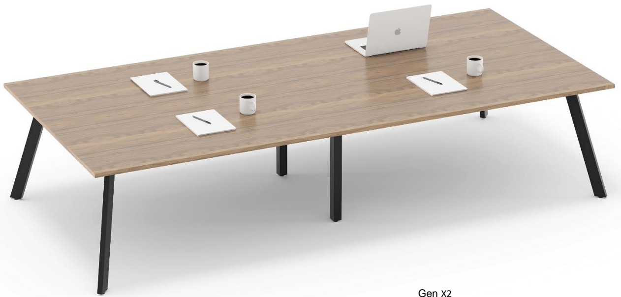
Gen X2 Model: X2-MT2-1200 Meeting tables with 2 pc top on 1200 end legs and recessed shared leg