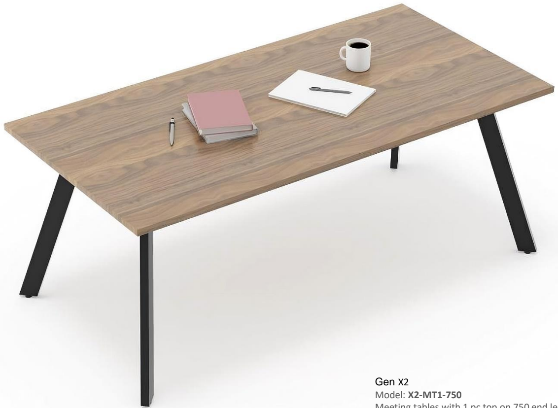
Gen X2 Model: X2-MT1-750 Meeting tables with 1 pc top on 750 end legs