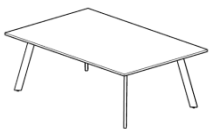
Meeting Table 1pc top ( 1500 leg )

1600 x 1500-1600 1800 x 1500-1600 2100 x 1500-1600 2400 x 1500-1600