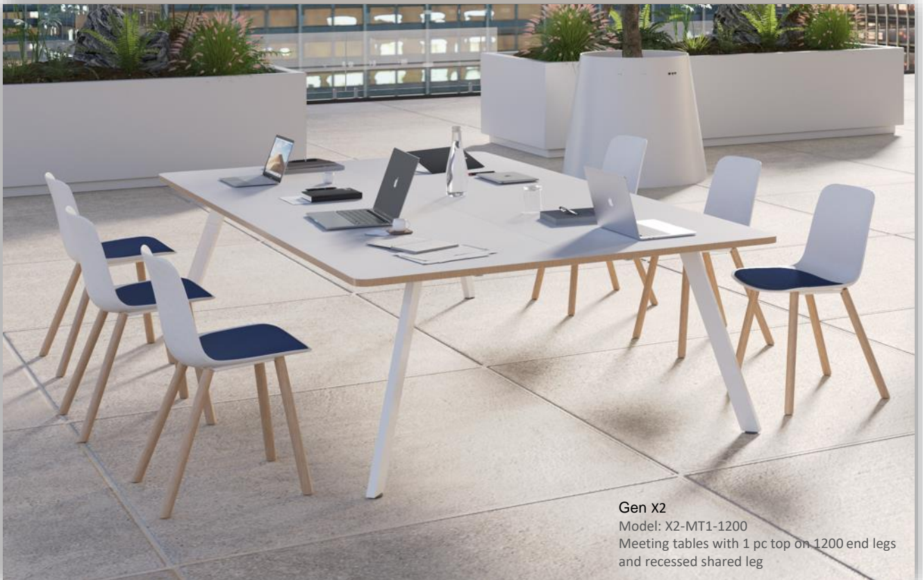
Gen X2 Model: X2-MT1-1200 Meeting tables with 1 pc top on 1200 end legs and recessed shared leg